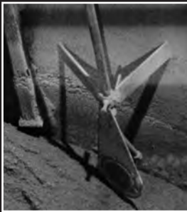
Model G BINATROL ® diaphragm switches are in use at this ready-mix plant as high-level alarms.

Monitor's line of BINATROL ® diaphragm bin monitors consists of economical, reliable, and durable point level controls for point level detection of dry bulk materials. The units can be used to eliminate bin overflow, maintain a predetermined material level, indicate plugging of chutes or conveyors or provide any of a number of level control functions. The flush mount, non-intrusive BINATROL units are ideally used when vessel size or internal clearance is limited, or where protrusion into a vessel is not acceptable. All installation and servicing, including diaphragm replacement and sensitivity adjustment, can be done from outside the vessel.