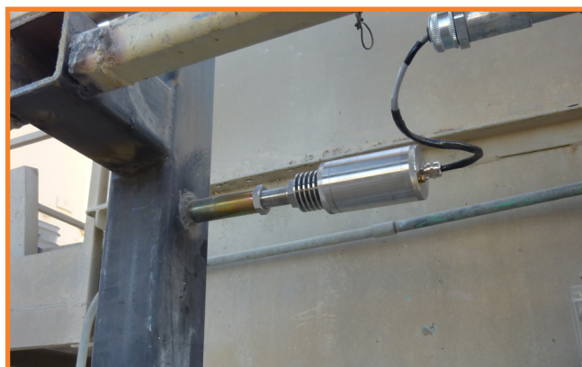
Mass flow measurement of dry sand