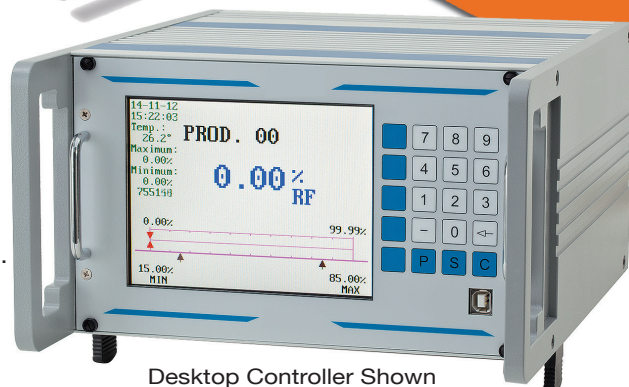
Desktop Controller Shown